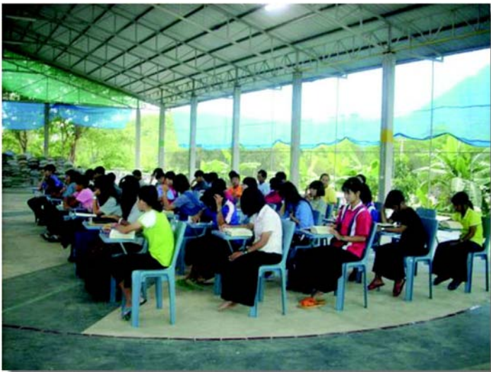
Bible students in class