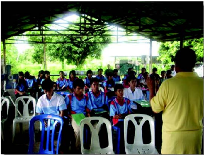
The home school gets a lesson in micro organisms.