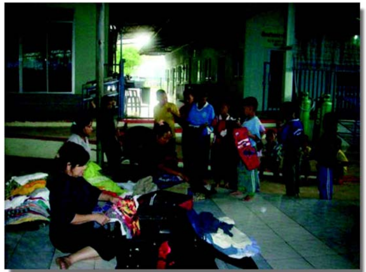
Bonee brings clothing for the home.