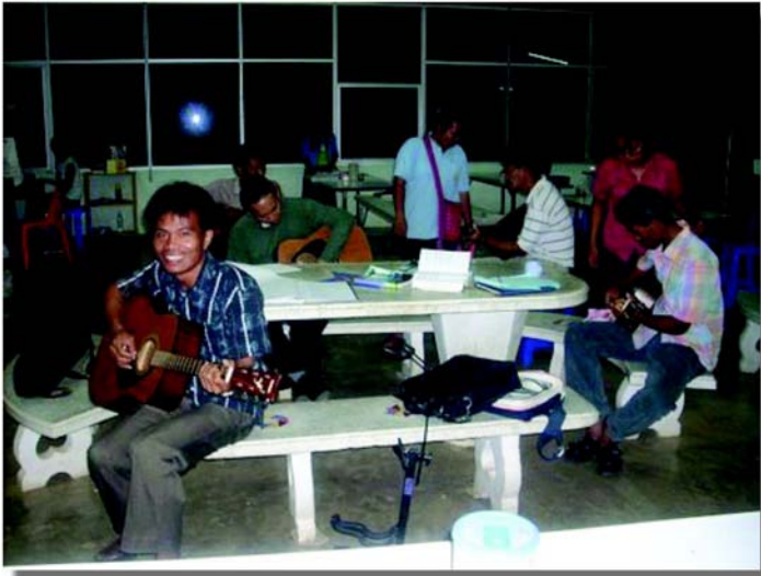
Bible students preparing for ministry in music