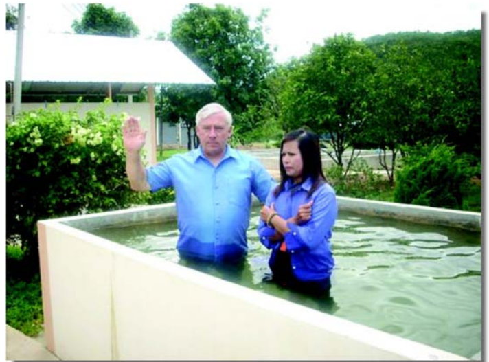
Khun Meow baptized