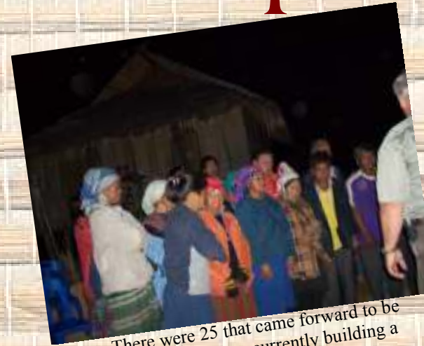
There were 25 that came forward to be baptised. We are currently building a baptismal tank for this village.