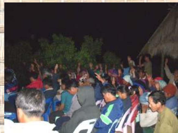
Many hands were lifted during the invitation. Praise the Lord for those who were willing to make a public profession.