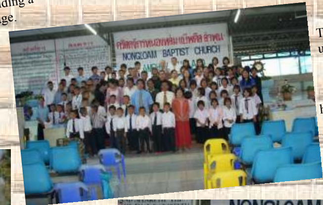
The Lord has blessed us with a tremendous church family at the Nong Loam Baptist Church. Without the help of all these people the conference would have not been possible.