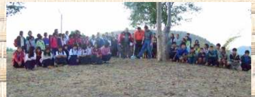
We were able to break ground on the proposed Christian School. We have one year from this date to have the construction complete. Please pray with us that the funds will be available to complete this much needed project.