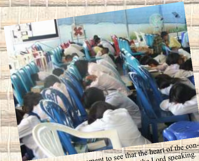
It was an encouragement to see that the heart of the congregation was soft enough to hear the Lord speaking.