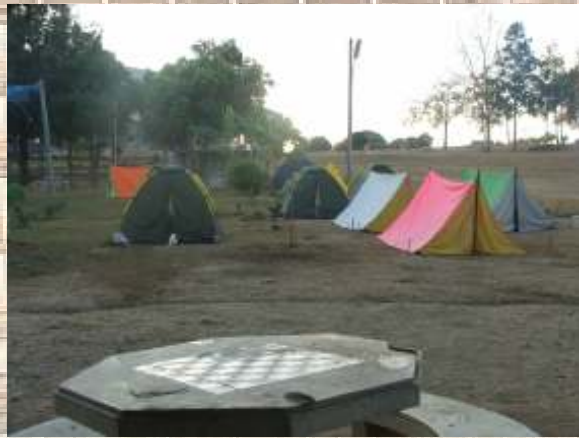
This is part of "tent city." During our annual missions conference many of the hilltribe villages come to the home to enjoy the conference. We have so many people coming that we have to set up tents all over the property to provide sleeping accommodations.