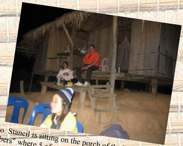
Bro. Stencil is sitting on the porch of the "prophet chambers" where 5 of us would be sleeping that evening.