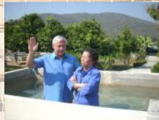
We are always glad to see those that receive Christ as their personal Savior to follow him in believer's baptism. Amen for the 2 that were baptized during the conference!