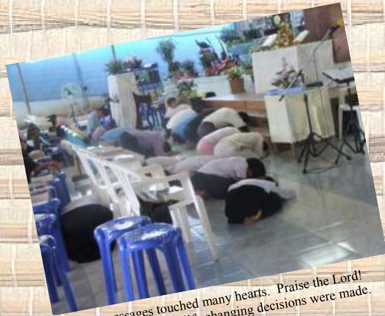
The messages touched many hearts. Praise the Lord! We pray that many life changing decisions were made.